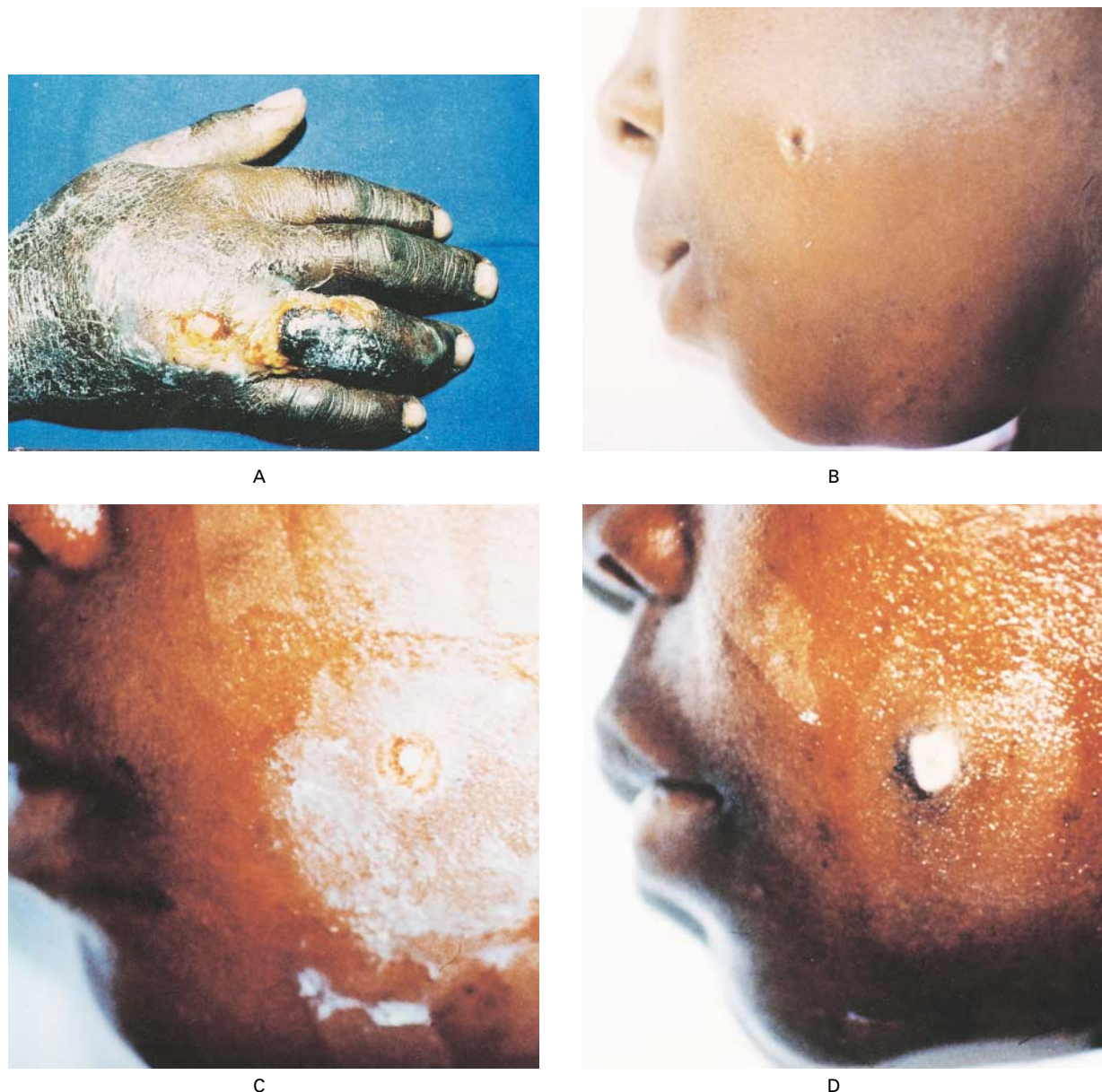
Figure 2. Cutaneous Anthrax Infection of the Hand and Cheek.

Panel A shows the characteristic blackened eschar surrounded by eroded areas and massive edema. These lesions are painless. The areas of “dried skin” represent resolving edema. Lesions continue to progress despite rigorous antibiotic treatment. Cutaneous anthrax can be self-limiting, and the lesions resolve without scarring. About 10 percent of untreated cutaneous anthrax infections progress to systemic anthrax. Panels B, C, and D show changes in the lesion on the cheek over a seven-day period. The characteristic blackened eschar is present on day 0 (Panel B). Facial edema and ulceration occur by the second day (Panel C). On day 7, the lesion is beginning to heal, and the facial edema is resolving (Panel D).