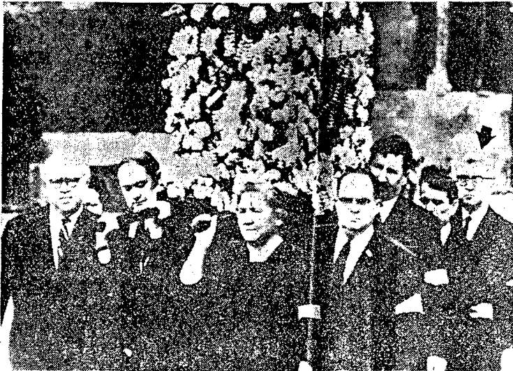
AT MOSCOW FUNERAL in September of 1964 of Mrs. Elizabeth Gurley Flynn, chairman of the United States Communist Party, Herbert Aptheker, indicated by arrow at right, walks in the procession. Mrs. Nikita Khrushchev is in the front row of the group bearing the ashes of the American Com-