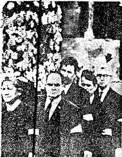
of 1964 of Mrs. Elizabeth Gurley Communist Party. Herbert Aptheker, procession. Mrs. Nikita Khrushchev the ashes of the American Com-